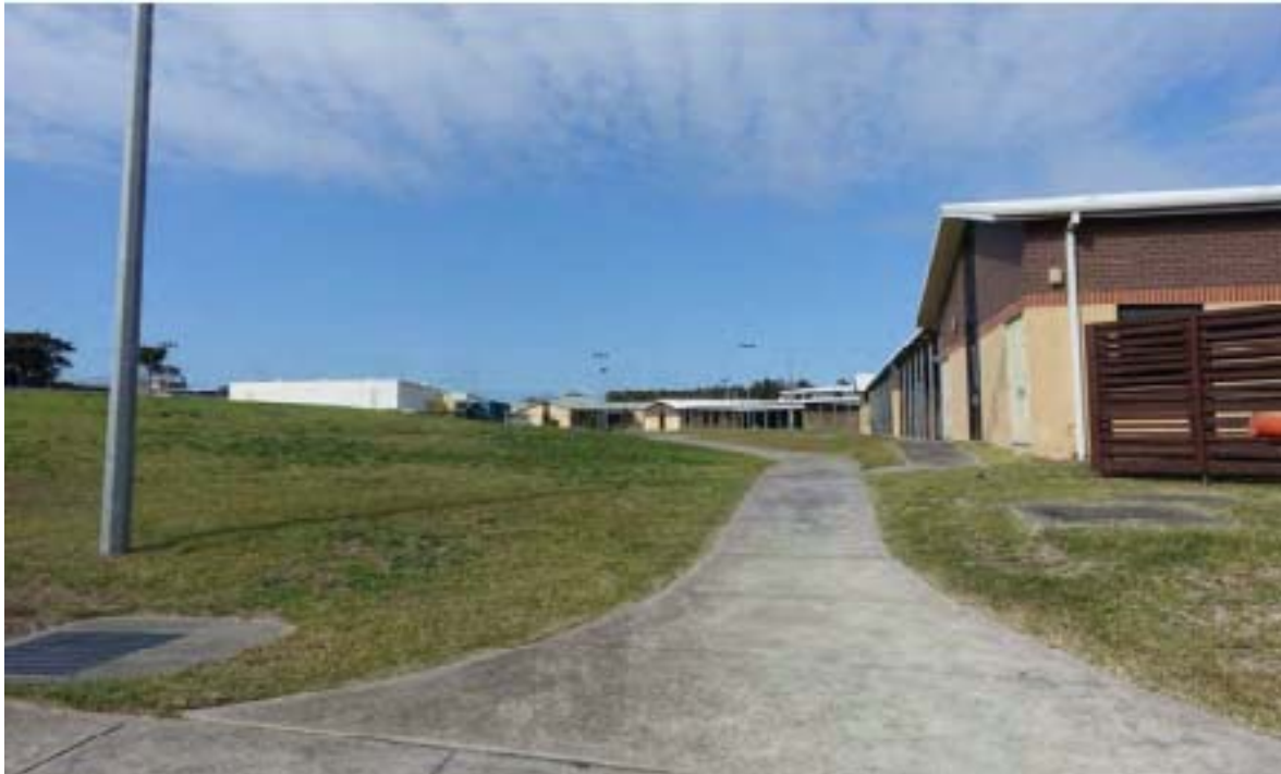
Figure 2: Existing buildings within Forensic Hospital complex