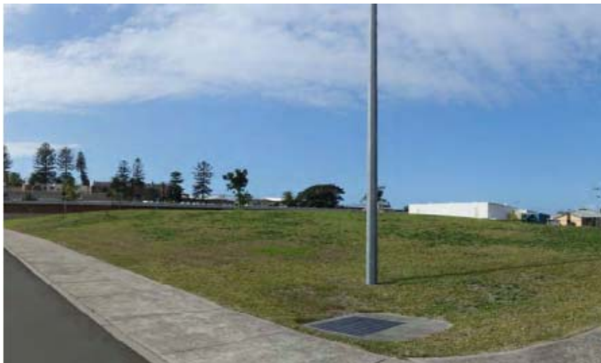
Figure 3: Location of proposed Freshwater House complex