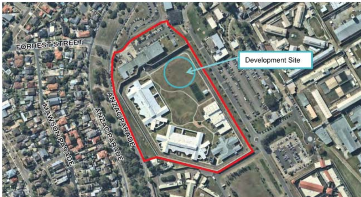
Figure 1: Development site within Forensic Hospital complex adjacent to main buildings of Long Bay Gaol

The Long Bay Correctional Centre is listed as an item of State heritage significance on the State heritage register and is also listed on Schedule 5 of the Randwick Local Environmental Plan 2012.