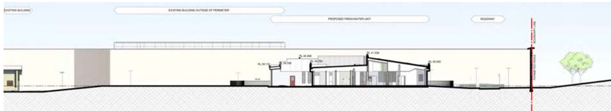
Figure 6: Section showing proposed facility sitting below existing surrounding perimeter wall.

The proposed new building will be located at some distance from the original buildings on the site, which are elevated approximately 10m higher than the location of the Forensic Hospital site. The low-rise nature of the new building within the higher perimeter wall will ensure that the building will not be visible from outside the Gaol site. Similarly, views towards the early built and landscape elements from within the Forensic Hospital site will not be impacted by the new development. Relevant objectives detailed above are therefore deemed to be satisfied.